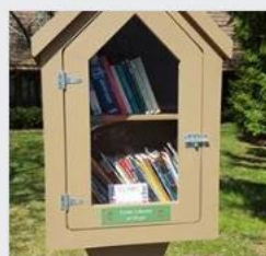
Hope United Methodist Church

Visit and "LIKE" the Hope UMC Facebook page